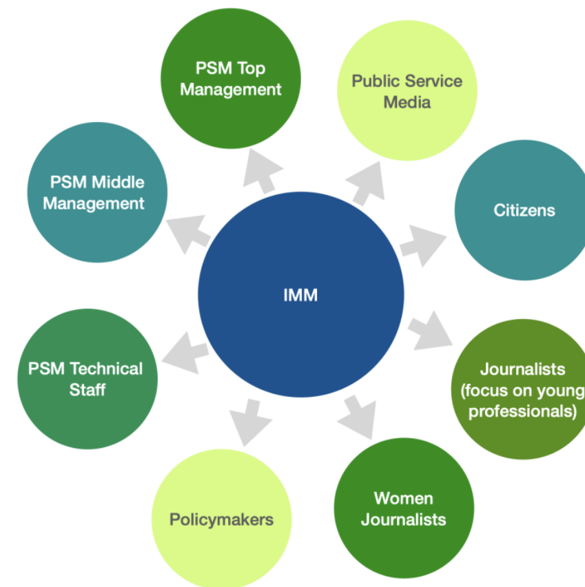
IMM Target Audiences.